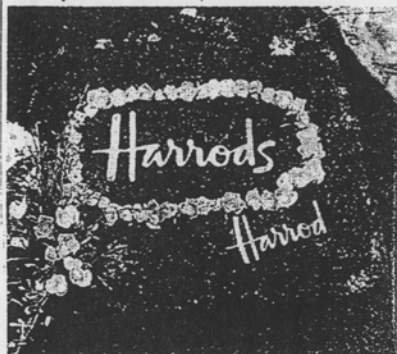
Bye petal... green and gold Harrods wreath

"She will be missed by the people of London — except perhaps the police and the Oxford Street shopkeepers' association."