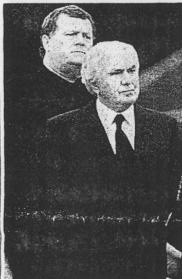
Mourner... train robber Buster Edwards